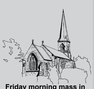
Friday morning mass in the Chapel 8.15am

Thurs 9 Nov 12:30 - 4:30 Fri 10 Nov 10:00 - 1:00 Thurs 16 Nov 10:30 - 1:30 Fri 17 Nov 10:00 - 1:00 Thurs 23 Nov 12:30 - 4:30 Thurs 30 Nov 10:30 - 1:30 Thurs 7 Dec 12:30 - 4:30