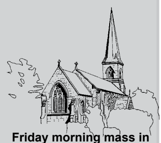
the Chapel 8.15am