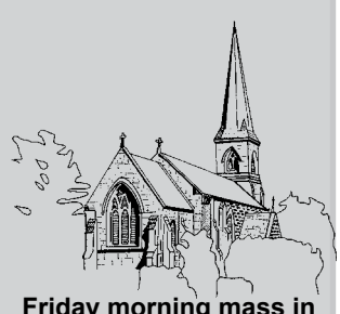
Friday morning mass in the Chapel 8.15am

Weds 5 Oct 10:30 - 1:30 Thurs 6 Oct 10:30 - 1:30 Weds 12 Oct 10:30 - 1:30 Thurs 13 Oct 10:30 - 1:30