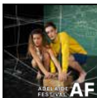
Us / Them