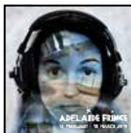
WE LIVE BY THE SEA