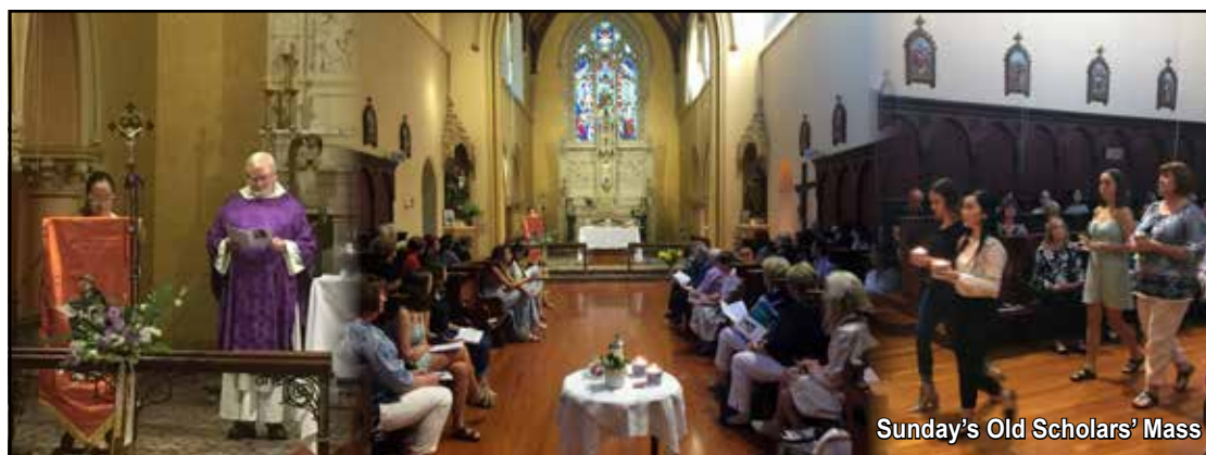
Sunday's Old Scholars' Mass