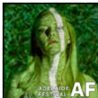
In The Club