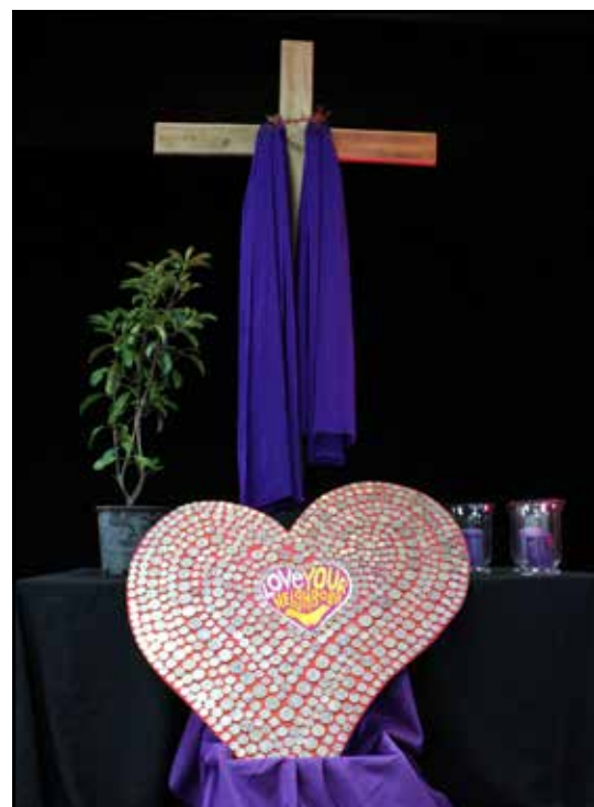
Caritas Lenten Theme: LOVE YOUR NEIGHBOUR

Can you dig deep with some extra loose change for our Project compassion gift to Caritas International? Each year our objective is to raise $10,000. We still have a few thousand dollars before our target is reached with the closing date next Holy Thursday. Please support your daughter's class total.