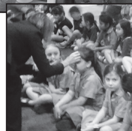
LENT IN THE PRIMARY SCHOOL the '40 Days of Loving' foyer display & Ash Wednesday Liturgy