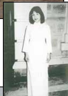
RIGHT: Nga 1982 early Vietnamese Refugee