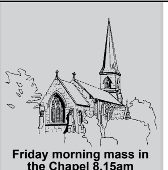
the Chapel 8.15am