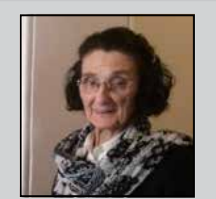
Requiescat in Pace