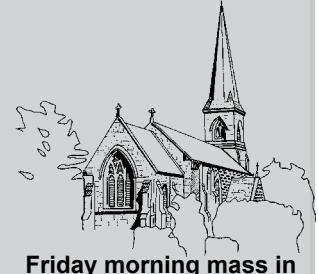
riday morning mass in the Chapel 8.15am