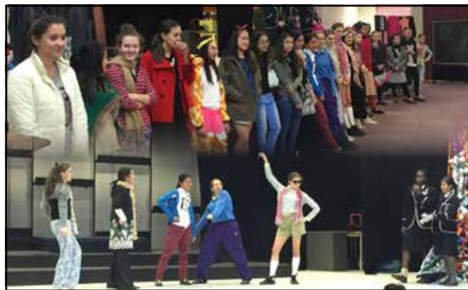
St Vinnies Fashion Parade

As the warm and sunny days of summer have finally waved goodbye and wintery conditions have settled in, we are reminded of the luxuries we have that comfort our lives. Warm clothing on chilly mornings, hearty meals to fill our tummies and heated homes to return to at the end of a long day. Our Vintage Vinnies Fashion Parade was a showcase of the generosity from our community with many classes donating a range of warm winter clothes as modelled by our students. It was the Year 7 and 10W classes that won the acclaimed titled of 'best dressed' through their donations and creative style. Many thanks goes to all members of our Vinnies Group particularly our Year 11 leaders who were instrumental in the organisation of the event. The Vinnies Group still welcomes further donations of clothing, blankets, cans and non-perishable food items up until week 10. Many thanks.