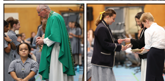
INVESTITURE MASS | Tuesday 25 February 2020

to unforeseen circumstance our Sports Day will now be celebrated on Sunday 29 March. I apologise for this change in date. I am very much looking forward to seeing all families as we gather as a community to connect with each other whilst cheering on our girls.