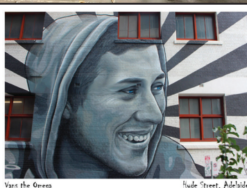
Vari the Greys