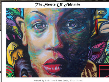
The Streets Of Adelaide