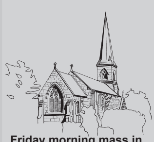
Friday morning mass in the Chapel 8.15am

7 Sept 10:30 - 1:30 8 Sept 12:00 - 2:00 [FRI] 14 Sept 12:30 - 4:30 21 Sept 10:30 - 1:30 28 Sept 12:30 - 4:30